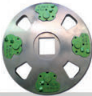
Toolholder with Diamond-Grinding and PCD segments

For difficult removals (Mastic, adhesives, etc.)