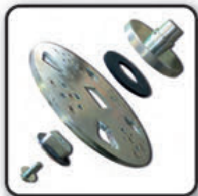
Toolholder for segments, vibration dampening ring