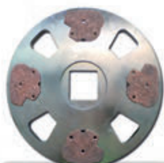
Toolholder with tungsten abrasive coated segments

For difficult removals (Mastic, adhesives, etc.)