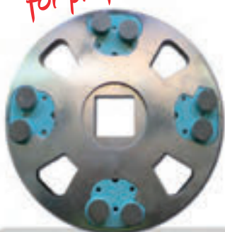
Toolholder with Diamond-Grinding Segments