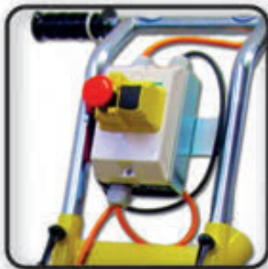
Emergency ON-OFF switch with lanyard